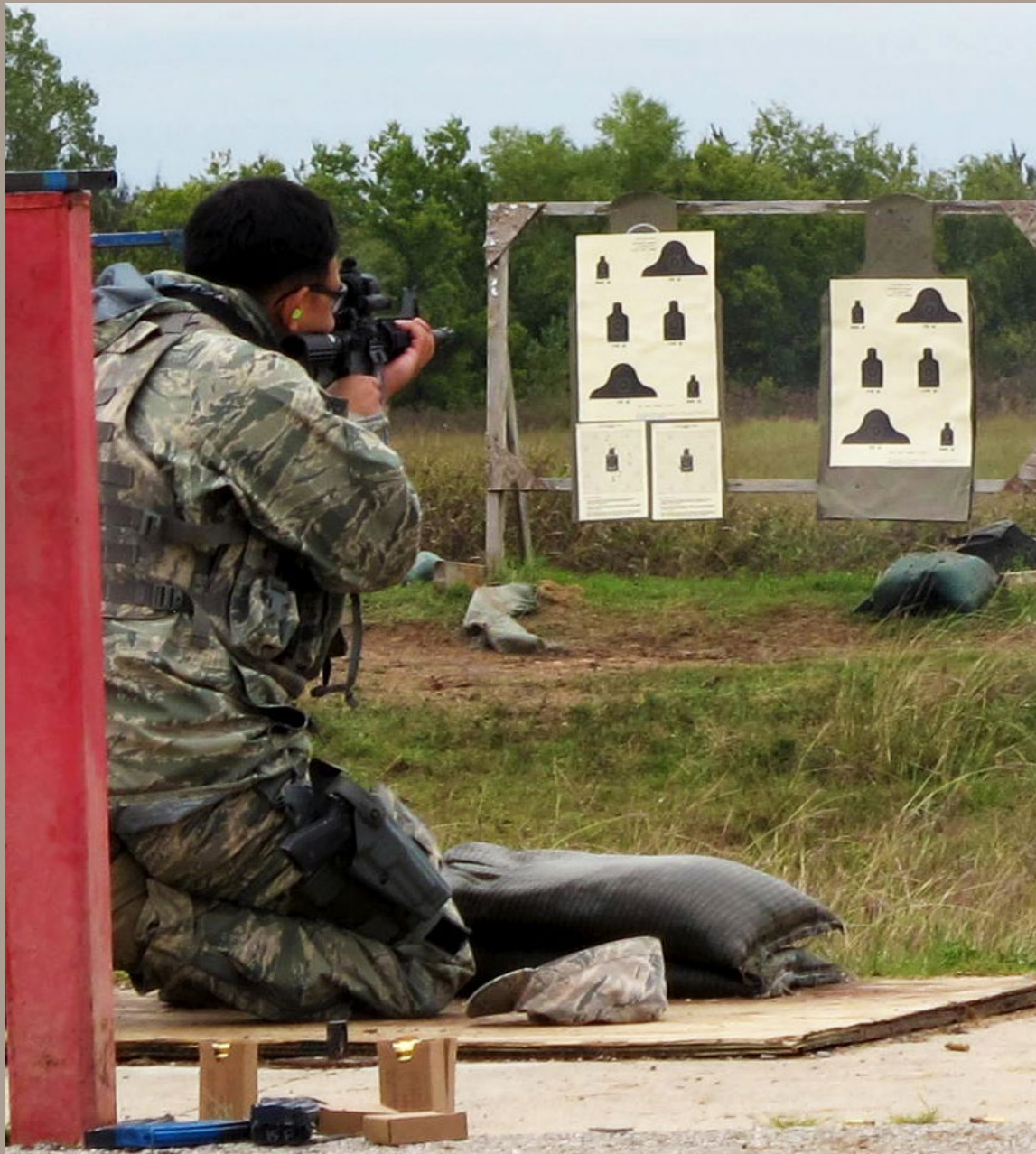
A member of the 507th Air Refueling Wing completes weapons qualification training Oct. 13, 2018, at Fort Sill, Oklahoma. The Tinker Air Force Base Small Arms Range is undergoing maintenance, and members will qualify at Fort Sill until the completion of the renovation.