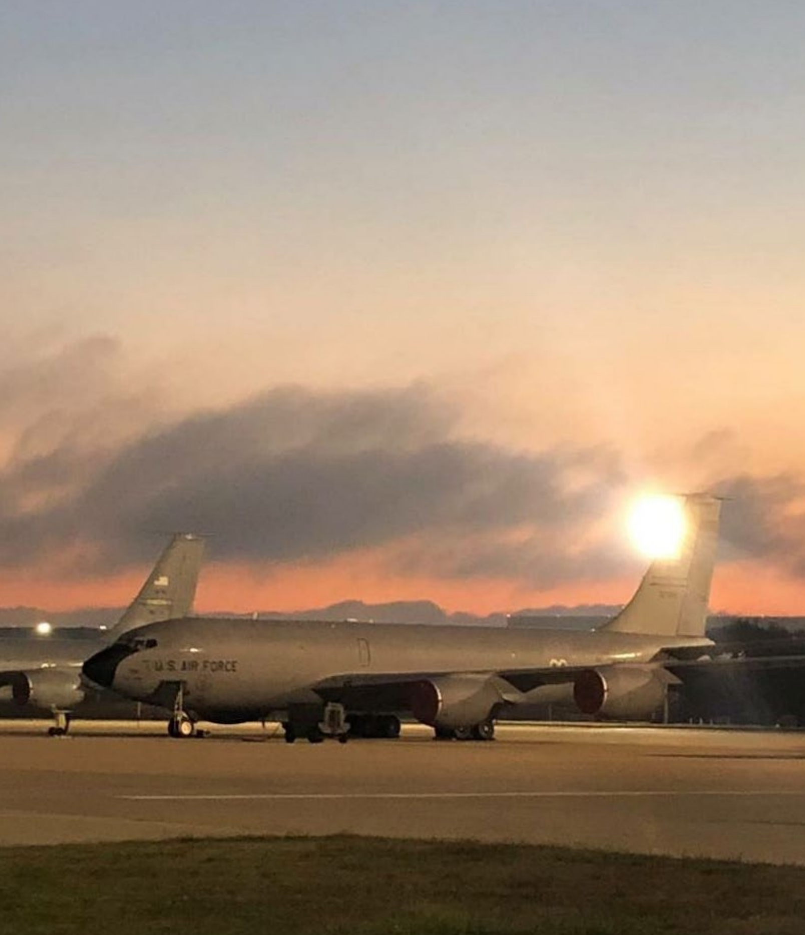
The 507th Air Refueling Wing flightline the morning of Oct. 26, 2018, at Tinker Air Force Base, Oklahoma.