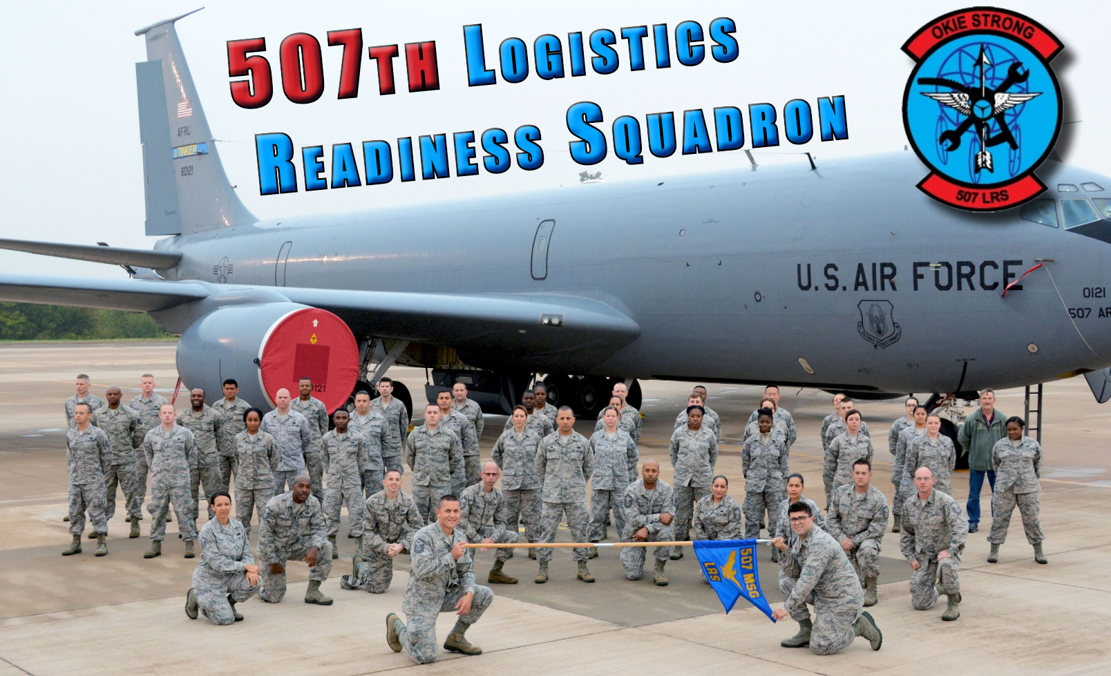
Members of the 507th Logistics Readiness Squadron pose for a photo Oct. 14, 2018, on the flightline at Tinker Air Force Base, Oklahoma.

T he 507th Logistics Readiness Squadron combines planning, supply and transportation skills into one organization, under one commander, with all the resources to keep pace with the swift demands of deployment, employment, and sustainment support requirements.